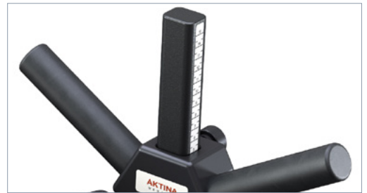
Y Arm Positioner Ant-Post