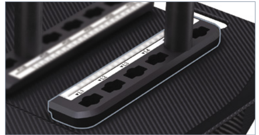
Vertical Hand Grip - Left Side