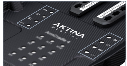
Indexing Bar Spot