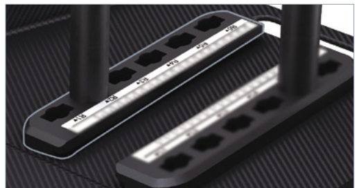
Vertical Hand Grip - Right Side