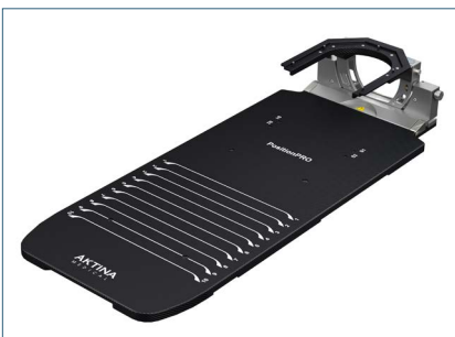
Head and Neck Module

The cross-platform design permits use with all manufacturers and the HexaPOD friendly width allows use with the Elekta HexaPOD system.