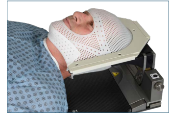
Head and neck module shown