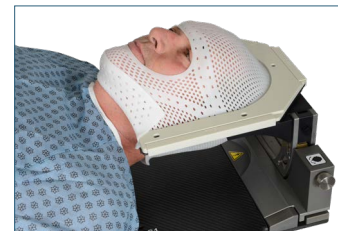
Head and neck module shown